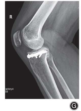
Fig 5 Anteromedial + anterolateral tibial plateau fracture. Male, 33 years old. (A, B) X-ray shows that no fracture could be seen. (C, D) 3D CT showed the compression of anteromedial + anterolateral tibial plateau, which was located behind the patellar tendon. (E, F) The fracture were reduced and fixed with a horizontally-oriented rim plate. (G), The fracture healed and satisfactory reduction had been achieved 1 year postoperatively.