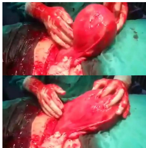
Figure 2. The anterior surface of the uterus obviously showing no incisions.

When the uterus rotates around its vertical axes for >45^\circ , it is called UT [3]. The UT angle range is between 45 and 180° [3]. However, the 180° UT has been reported in a few cases [3–5, 8, 10], (Fig. 1). Although 1/3 of the reviewed cases are levotorsion, 2/3 of most cases are Dextrotorsion [3], (Fig. 1). Although the etiology is unknown for 20% of cases [1, 2, 9], most cases are accompanied by a structural abnormality of the uterus, previous posterior lower segment incision, leiomyoma and adnexal cyst, abnormal fetal position [5]. In this case, the cause is suggested to be uterine ligament relaxation as it is re-rotated after the first attempt of correcting the UT manually and placing the uterus in the pelvic. Nevertheless, fetal malpresentation can occur [4, 6, 10] while it was normal in our case. A history of uncomplicated vaginal delivery was reported [6, 9], whereas a lower segment cesarean section history was recorded in our case. The clinical presentation