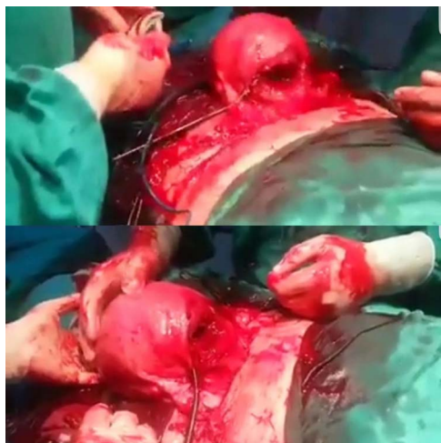
Figure 1. Exteriorizing the uterus intraoperatively to correct its position by rotating it 180° around its longitudinal axis. The arrow illustrates the posterior low transverse uterine incision.

was exteriorized from the abdominal cavity to correct its position by rotating it 180° around its longitudinal axis. The transverse incision on the posterior lower uterine segment has been closed (Fig. 1) without performing any incision on the uterus's anterior surface (Fig. 2). After repositioning the uterus into the abdomen, a uterine retorsion occurred spontaneously. Due to the retorsion and to ensure the stability of the uterus in its normal position, both RL were suspended to the most proximal portion of the uterine cornu penetrating the lateral edge of the rectus abdominis muscle, and then the thread was fixed to the muscle fascia. After 6 months, the patient conceived, and the pregnancy continued without obstetrical complications until the 38th GW, despite the risk of uterine rupture (UR) because of the posterior hysterectomy. An elective cesarean section was performed, and the uterus was normal. Slight adhesions were observed and removed at the site where the RL was attached to the rectus abdominis muscle fascia. On examination, the scar on the posterior UW was normal with no adhesions. After 3 years, the fourth pregnancy occurred. The patient presented at the 33rd GW with premature labor associated with ketoacidosis which was treated immediately. The fetus was delivered, then placed in an incubator. Some adhesions were observed on the posterior uterine scar, but no recurrence of torsion was recorded.