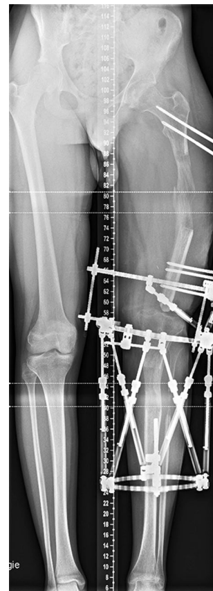
Fig. 4 Radiological findings 250 days after injury preoperatively before nailing procedure

The debate continues over to perform primary amputation or limb salvage in a high-energy, complex open fracture with extensive bone defect in the lower extremities [3]. Both strategies have advantages and disadvantages. Aside the functional loss, body image and mental health issues after primary amputation surgery, patients can be at risk for