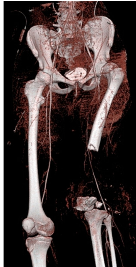
Fig. 2 Computed tomography (CT) angiography demonstrates a complete dislocation of the left hip, segmental bone defect of approximately 26 cm of the distal femoral bone without signs of injury to the popliteal artery

Anteroposterior and lateral radiographs after surgery revealed an appropriate position for the bone cement spacer. The Epigard cover was changed every 2 days until the wound was clean and able to be covered by meshed skin grafting (Fig. 3). A long-cassette radiograph and clinical evaluation revealed a limb length difference of 10 cm with the bone cement spacer in situ. Bifocal bone lengthening of both the femur and tibia was planned due to the total length of the bone defect. A mono-lateral external