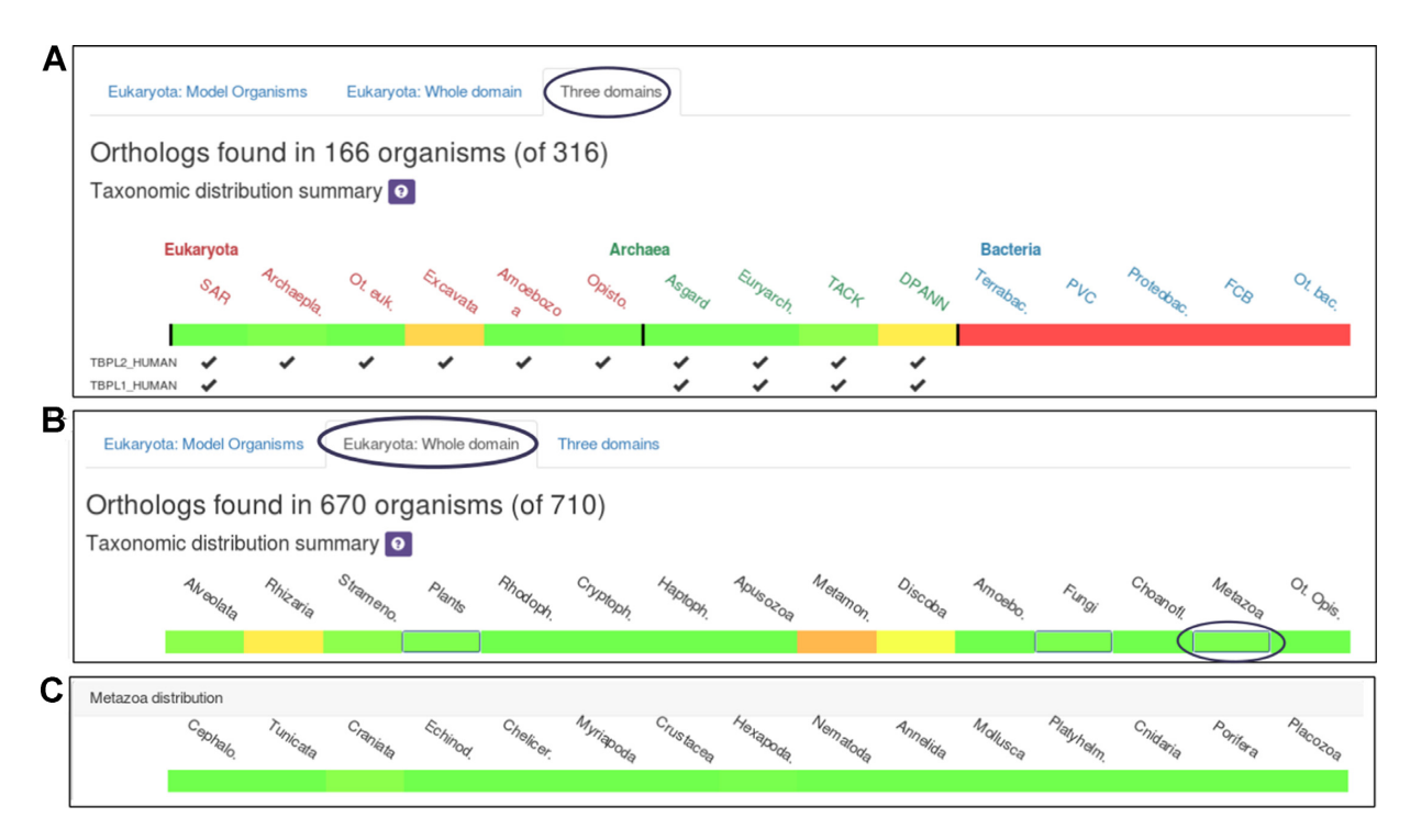
Figure 2. Taxonomic distribution heatmaps. Each labelled tile corresponds to a clade and is colored according to the proportion of species in the clade with at least one ortholog. Colors range from red (no species) to green (all species). (A) Heatmap corresponding to the cross-domain database. The domain of life of the clades is shown by an additional label and a color code. Inparalogs distribution is indicated by a tick under each clade. (B) Heatmap corresponding to the eukaryotic database. The box framed by a thin blue outline can be expanded to 'focus view'. (C) Heatmap corresponding to the 'focus view' of Metazoa.

about the timing of each duplication during the gene's evolutionary history (Figure 2A). For example, an inparalog of a human protein found in relation to all species except Opisthokonts may indicate a duplication of the ancestral gene in the Opisthokonta common ancestor.