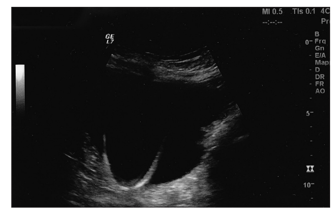
Figure 1: Nephrostomy catheter position under ultrasound guidance

The mean size of the renal cysts in the pretreatment imaging study was 82 mm (range 68-145 mm) for the ethanol group and 77 mm (range 57-138 mm) for polidocanol group. In 79% of cases we found individual cysts with sizes from 73 to 145 mm.