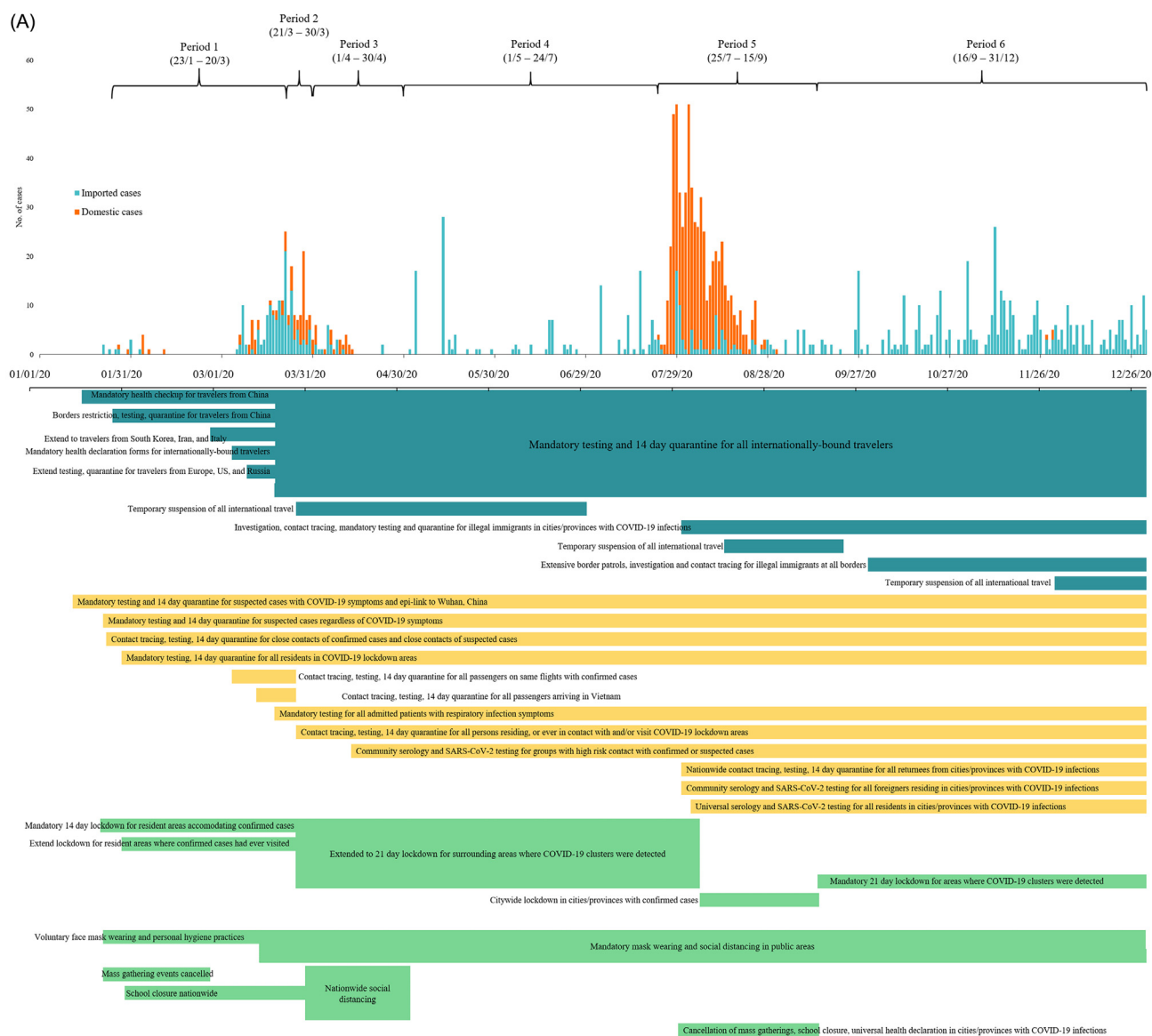
Figure 2. (A) Epidemic curve by date of confirmation and public health interventions across the six periods from January to December 2020. Confirmed cases of COVID-19 are represented by (i) imported cases (infection most likely acquired outside of Vietnam) (blue) and (ii) domestic cases (infection most likely acquired inside of Vietnam) (orange). Public health interventions are represented by three groups: (1) travel-related measures (teal); (2) active case-finding measures (yellow); and (3) other non-pharmaceutical interventions (green). (B) Distribution of the daily estimated reproduction number of COVID-19 transmission in Vietnam from January to December 2020. The solid black line marks the median of effective reproduction number, the dashed horizontal line represents the value '1' of the effective reproduction number, and the grey areas represent the 95% confidence interval.

Data of 713 cases were used to calculate containment delays, defined as the time between a case's symptom onset and start of quarantine, while 761 imported cases who immediately isolated upon arrival to Vietnam were excluded. Overall, the mean containment delay was 1.62 days (95% CI 1.38–1.86) with a standard deviation of 3.31 days (95% CI 3.15–3.50) (Supplementary Material Table S2). For the 201 cases who were symptomatic at testing, a longer mean containment delay was observed (5.04 days (95% CI 4.40–5.69)). There were significant differences in the mean containment delay for cases detected by different modes of detection. While all cases detected during periods 4 and 6 reported zero days of containment delay, there was a temporal fluctuation in the