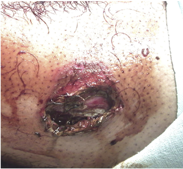
Fig. 3. Entry wound at the thigh.

The patellar fracture occurred in a patient who reported that the muzzle of the gun was kept on his knee before he was shot. Almost all other patients reported that they were shot from close range. A majority of the patients had been shot through the clothing that they were wearing.