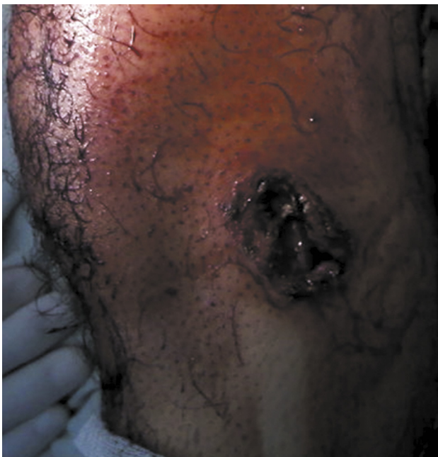
Fig. 4. Entry wound of the bullet entering the knee. The bullet was in an intraarticular location.

Four patients reported with nerve injuries. After wound debridement, conservative management was done. The sural nerve injury did not recover. There was partial recovery of the common peroneal nerve injury in the 2 patients who had complete involvement of that nerve at presentation. The patient with the posterior interosseus nerve injury refused a tendon transfer surgery which was offered 1 year after the injury.