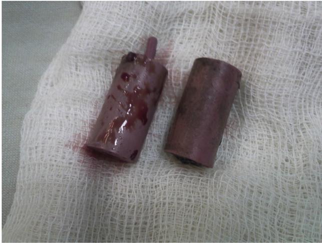
Fig. 1. Photograph of the rubber bullets.