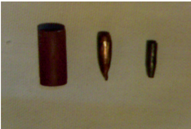
Fig. 2. The rubber bullet in comparison to conventional munitions.

examination of the patients was recorded and relevant investigations ordered. Radiographs of all the patients were taken and studied. Relevant findings were noted down.