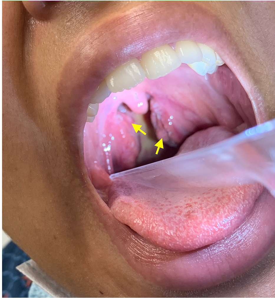
FIGURE 2: Clinical photograph of patient's oropharynx

The patient had an elevated white blood cell count in response to the tonsillar infection (Table 1). Head and neck computed tomography scans revealed moderate heterogeneous prominence of the bilateral palatine tonsils with a small tonsillar abscess (15 mm hypodensity on the left) (Figure 3).