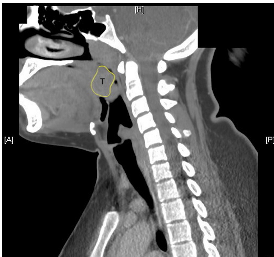
FIGURE 4: Sagittal-view computed tomography image demonstrating tonsillar abscess (T)

The patient was admitted to the hospital, seen by otorhinolaryngology, and treated with amoxicillin-clavulanate. Her symptoms subsided over a few days and the patient was discharged home.