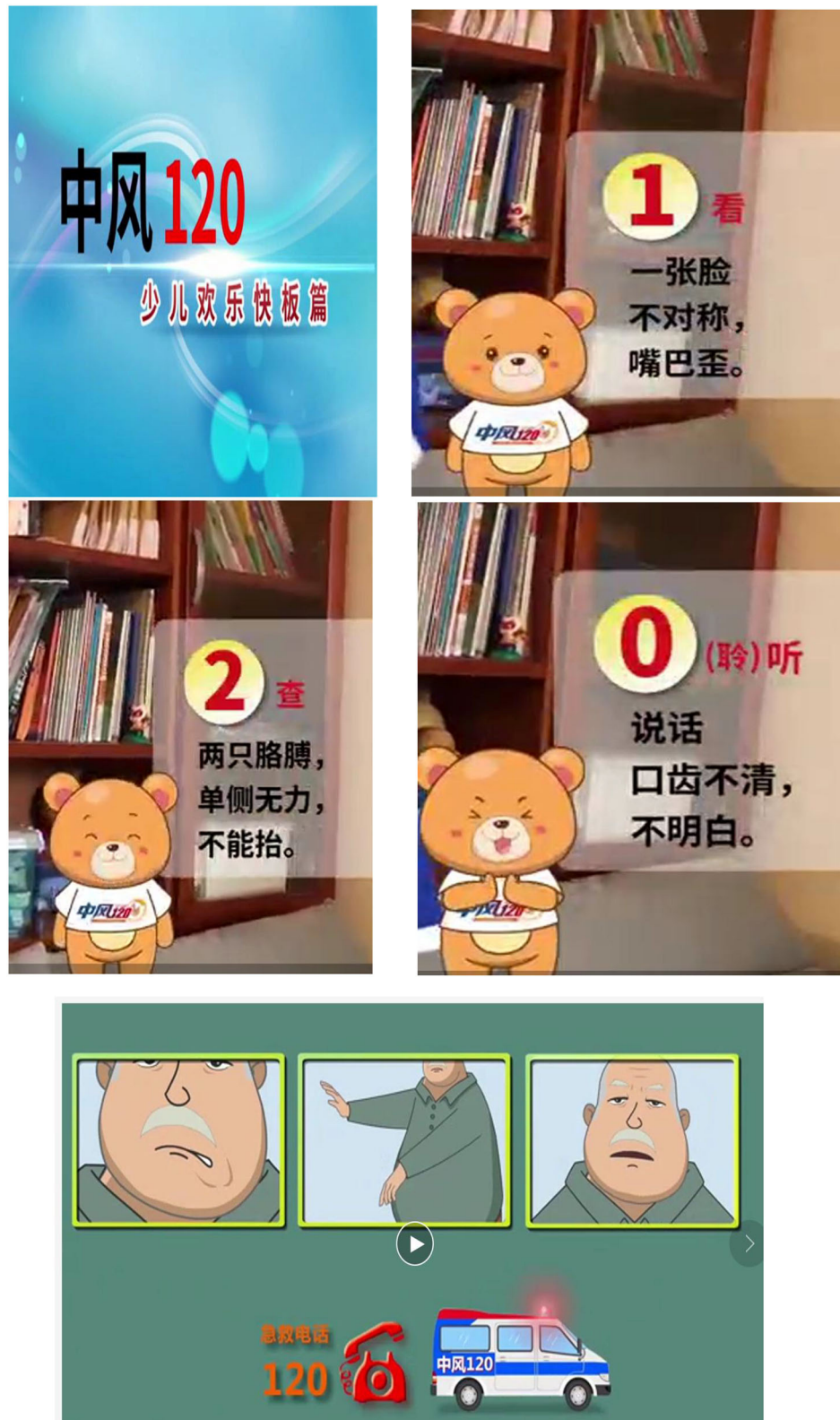
FIGURE 1 The educational videos for stroke 1-2-0.