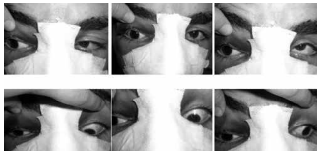
Figure 4. Case 2, adduction was limited about 15 degrees temporal to midline. There was a 45 PD exotropia in the primary position, increasing to 90 PD on left gaze and decreasing to 14 PD on right gaze without proptosis. Forced duction test was negative