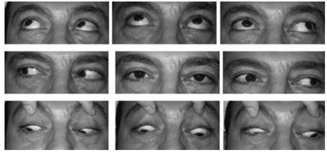
Figure 3. Case 1, at 8 months postoperatively, there was no face turn or exotropia in primary position, and 14 PD exotropia in the left gaze position