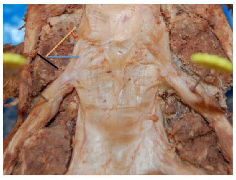
DRG Size (mm). Width is the width of DRG at the pin (maximal width of DRG). The nerve root angle is determined from sin(O) calculated by the right/diagonal lines relative to the width.

The greatest width of the DRG was 6.5mm both on the left and right of L5 (range 3.2-6.5mm)(Figure 1). The nerve root take off angle was largest at L5 on the left (range 50.5^{\circ}-58.8^{\circ} ) and L4 on the right (range 50.5^{\circ}-57.2^{\circ} ). The center of the DRG was found bilaterally in the medial zone of the foramen of L1-4 and the lateral zone at L5. (Figure 2) The foramina increased in size from L1 to L5 in both the ventral to dorsal and cephalad to caudal (pedicle to pedicle) direction. Pedicle width (medial to lateral) increased in size from L1 to L5 (Table 1).