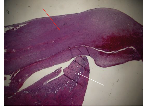
FIGURE 1: Macroscopic view. Note the sharp demarcation with normal myometrium (white arrow: normal myometrial tissue; red arrow: stromal nodular tissue).

A small study from 2005 showed a higher frequency of MIB-1 and a lower estrogen/progesterone receptor expression in endometrial stromal sarcomas than in endometrial stromal