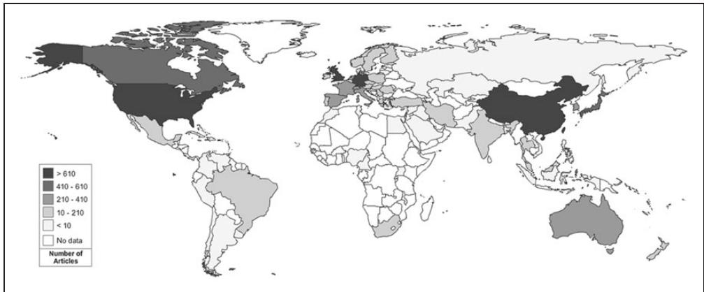
Figure 2. World map of scientific production from 2011 to 2015.

lower-middle-income countries. The top five countries were the United States (3664/11,590; 31.61%), the United Kingdom (1072/11,590; 9.25%), Germany (876/11,590;