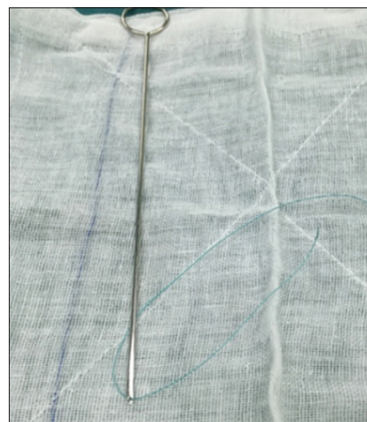
Figure 1: Homemade needle for pediatric inguinal hernia.

ring under the peritoneum and both ends exit the skin through the same puncture point and tunnel. Gas collected in the distal sac was squeezed out, the thread was tied tightly extracorporeally, and the internal inguinal ring was completely closed. The knot was placed underneath peritoneally, rather than subcutaneously. When asymptomatic contralateral PPV was observed, bilateral closure was performed. During the follow-up period, no recurrence, hydroceles, metachronous hernia, or testicular atrophy were detected.