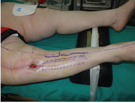
FIGURE 1: Knee wound secondary to a lymphocutaneous fistula.