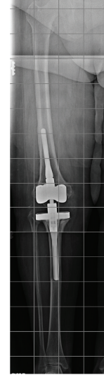
FIGURE 3: Hinged revision total knee arthroplasty after second stage replacement surgery.

Treatment of lymphorrhea includes different types of management which range from nonsurgical to microsurgery procedures. To date, there are no international treatment