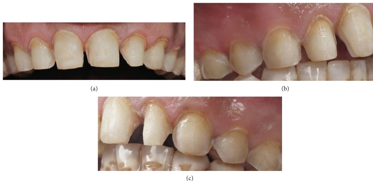
FIGURE 2: Maxillary tooth preparation: (a) frontal view, (b) lateral view: right side, and (c) lateral view: left side.