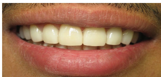
FIGURE 5: Final result.

excellent aesthetic results when an appropriate treatment plan and protocol are used during the clinical and laboratory fabrication stages. This case report describes the use of ceramic veneers to enhance the appearance of fluorosed teeth, thus improving the patient's smile and, consequently, self-esteem.