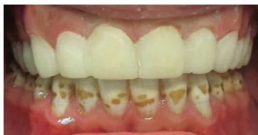
FIGURE 3: Temporary veneers.

Then, Heliobond (Ivoclar Vivadent, Schaan, Liechtenstein) was placed on the prepared tooth surfaces. The inner surface of the veneers was covered with light-cured resin cement (Variolink Veneer, transparent shade, Ivoclar Vivadent, Schaan, Liechtenstein). Veneers were positioned appropriately on the teeth by applying gentle pressure, following which excess resin cement was carefully removed with an explorer before light curing. Light curing was first performed for 2 seconds, and the excess resin cement was removed with a microbrush. After that, each veneer was light-cured from the facial aspect for 40 seconds and from the lingual aspect for 40 seconds. The two veneers of the central incisors were first simultaneously cemented. This was followed by cementation of the veneers of the two lateral incisors. Then, the veneers of the two canines were cemented. Finally, veneers for the first and second premolars were cemented simultaneously on each side.