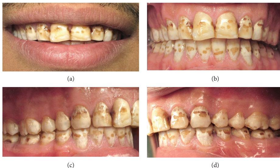
FIGURE 1: Preoperative clinical photographs: (a) smile, (b) frontal view, (c) lateral view: right side, and (d) lateral view: left side.

alginate impressions for diagnostic models were taken. The patient was presented with treatment options, which included ceramic or composite veneers, along with the advantages and disadvantages of each option. The patient agreed to smile enhancement using ceramic veneers for his upper teeth given that he desired an optimum aesthetic and a long-term result. The veneers would be placed on the patient's upper teeth, from his upper right 2nd premolar to upper left 2nd premolar. The patient decided to postpone veneering his lower teeth, given his limited financial capacity. Diagnostic models were analyzed to evaluate the occlusion, and a diagnostic wax-up was made of white-colored wax. The use of the wax-up allows the patient to preview the desired appearance of his teeth, and this wax-up is also essential for the fabrication of a clear matrix for temporary restorations.