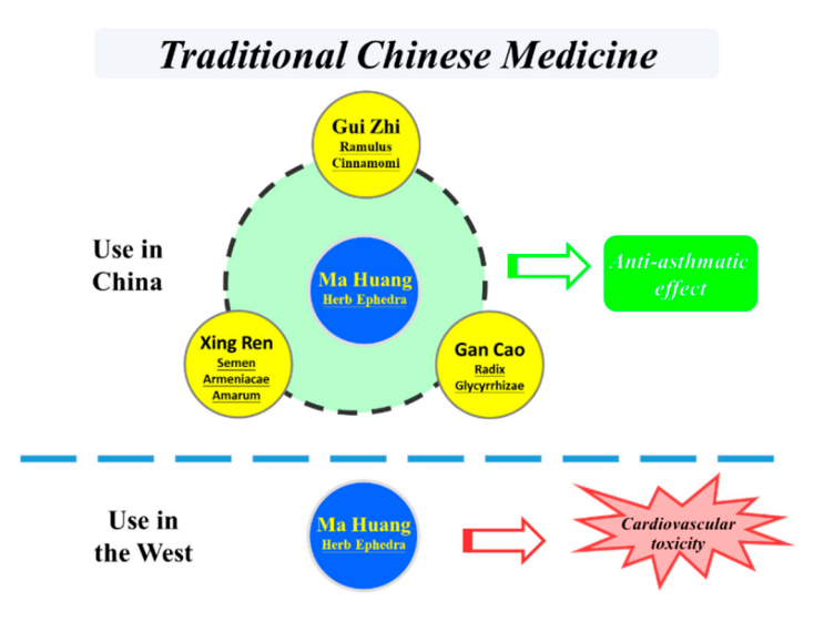
Figure 3. In TCM, herbs are combined together in a specific proportion to treat disease efficiently with low side effects. This is exemplified with the herb formula that contains Ma Huang as the most effect herb to treat asthma. In the West, Ma Huang is used alone and in relatively high doses, which is prone to cardiovascular side effects.