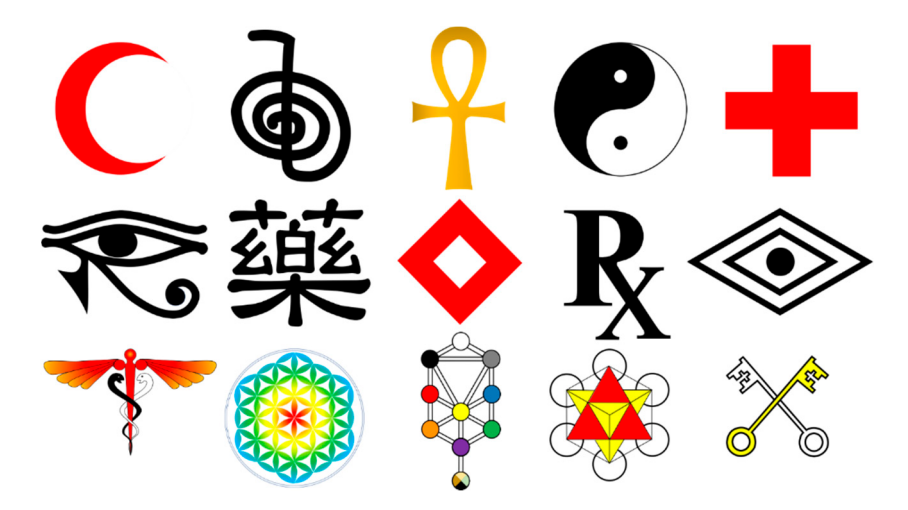
Figure 1. Symbols of health, medicine, and life in several cultures.

The number one desire of most people is to be in good health. This is also reflected by the high social status of medical professionals in all societies. In most cultures, the medicine woman/man has her/his own "uniform", uses a jargon that is not easily understood by others, and specific symbols are used (Figure 1).