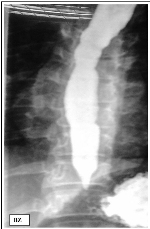
Fig.3: Pre dilatation barium swallow, dilated esophagus.

Allgrove's syndrome is an autosomal recessive disorder with varied presentations. 14,15 Recent studies have identified mutation in AAA syndrome of a candidate gene on chromosome 12 q 13 in