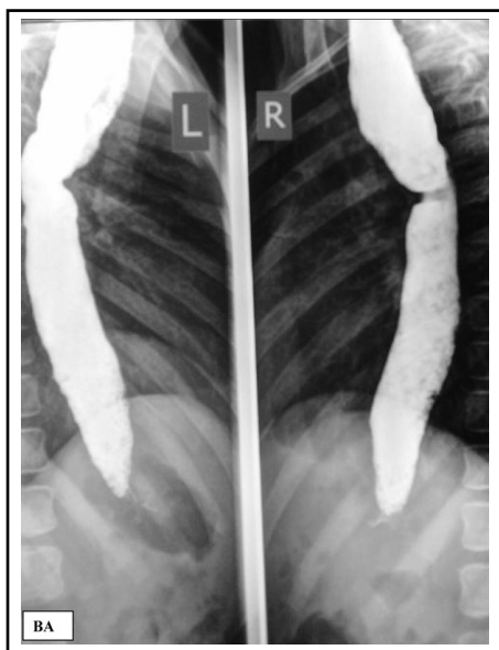
Fig.1: Pre dilatation barium swallow, dilated esophagus.

Based on presentation of achalasia, alacrima and adrenal insufficiency, diagnosis of triple A syndrome was made. She had pneumatic balloon