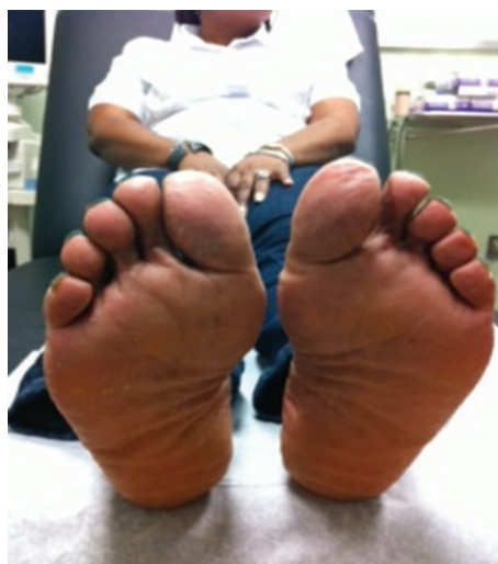
Feet after treatment