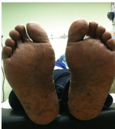
Feet before treatment