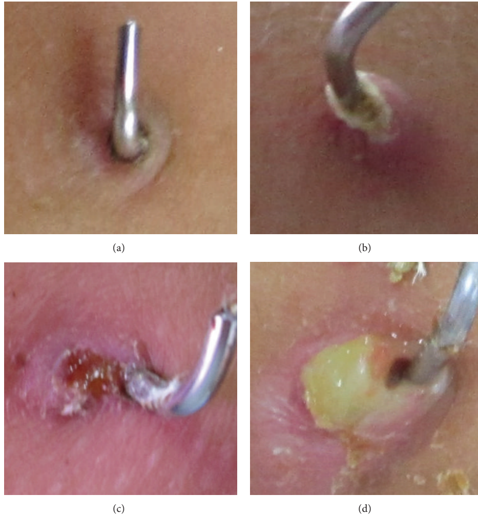
FIGURE 1: Pin site classification. (a) Normal skin. (b) Erythema without discharge. (c) Serous discharge. (d) Purulent discharge.

Forty patients had pin fixation in the high-temperature season; the other 21 patients had pin fixation in the low-temperature season. There were no significant differences in age, gender, BMI, injured side, number of pins, duration of pin retention, or pin care regimen between patients in the two seasons (Table 1). Patients in the high-temperature season were more likely to have type III fractures ( P = 0.037 ). The primary outcome measure of interest was the infection rate per patient. Pin site infection occurred in 18 (45%) of 40 patients in the high-temperature season and in 4 (19%) of 21 patients in the low-temperature season. The infection rate per patient was significantly higher in the high-temperature season ( P = 0.045 ).