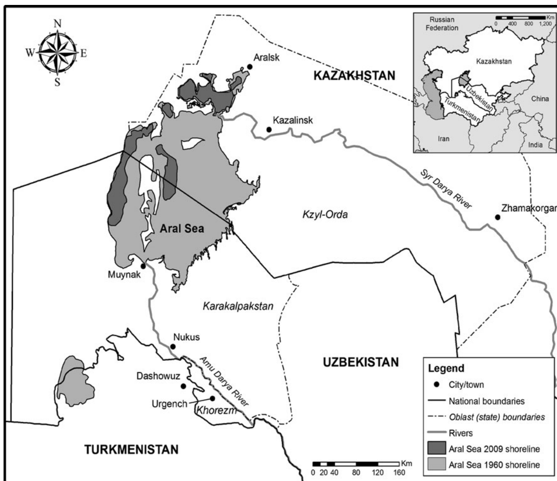
Fig. 1 The Aral Sea area

of gray literature (magazine and newspaper articles), NGO promotional material, conference abstracts, and a small number of studies that focused exclusively on adults.