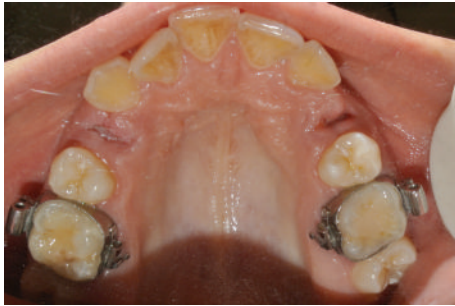
FIGURE 5: Clinical occlusal views 7 days after surgery. The sutures were removed. Both postextraction socket cavities presented a decreased volume and appeared epithelialized.