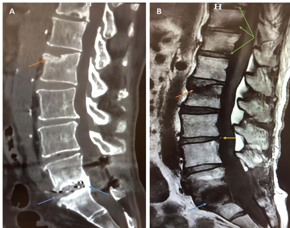
Figure 1 Lumbar spine imaging examination results revealed lumbar spine degeneration.

Notes: (A) Lumbar CT with three-dimensional reconstruction revealed: postoperative changes in L5-S1 vertebrae and intervertebral disc, narrowing of the intervertebral space, increased vertebral body density (blue arrow), and compressive changes of the L2 vertebrae (orange arrow). (B) Lumbar MRI revealed: L5-S1 vertebrae fixation (blue arrow); L3/4 intervertebral disc slightly bulged (yellow arrow); L2 vertebrae compression changes and abnormal signal (orange arrow); T11-L2 vertebrae abnormal signal (green arrow).