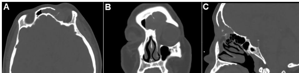
Fig. 1 (A) Axial, (B) coronal and (C) sagittal paranasal sinus CT images of a patient with recurrent frontal sinus inverted papilloma who suffered by persistent headache

This is a prospective study approved by the Ethical Committee of Tongji Hospital, Tongji Medical College, Huazhong University of Science and Technology. Adult patients (> 18 years) undergoing the Draf IIb procedure for recurrent frontal sinus diseases (2013–2021) were enrolled. All patients had been treated with at least one previous endoscopic surgery. Diagnosis was confirmed by symptoms and high-resolution CT scans (Fig. 1). During the study period, a LIPF technique was systematically performed unless a technical limitation was encountered or in the presence of an unhealthy flap mucosa due to severe polyposis or fibrosis. Demographics and indications for surgery were collected. Patients were sorted by operation time.