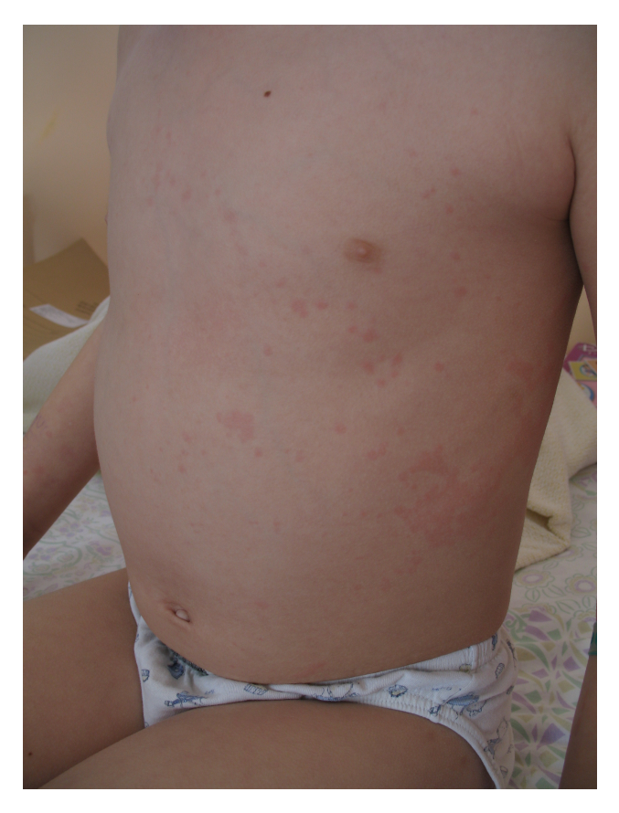
Figure I Evanescent (non-fixed) erythematous rash in an SJIA patient. Abbreviation: SJIA, systemic juvenile idiopathic arthritis.

Clinical presentation of SJIA differs from other JIA subtypes in several aspects: it includes typical quotidian fever, arthritis, and "salmon pink" rash that appears with the fever and fades away when the fever subsides (Figure 1). Lymphadenopathy, hepatosplenomegaly, and serositis, such as pericardial effusion, are also hallmarks of the disease and are not seen in other forms of JIA.7 SIJA patients are more prone to develop MAS. Some SJIA patients have a monophasic course of the disease with only one episode of fever, others have a polycyclic course, and in some patients the disease persists after the initial attack of fever and follows the severe polyarticular course.<sup>28</sup> Systemic signs of the disease can sometimes be more amenable to treatment than chronic arthritis, which can be unresponsive to various treatment approaches.<sup>29</sup> Early predictors of joint damage and poor outcome are young age at diagnosis (<18 months of age), longer disease duration, persistent systemic use of