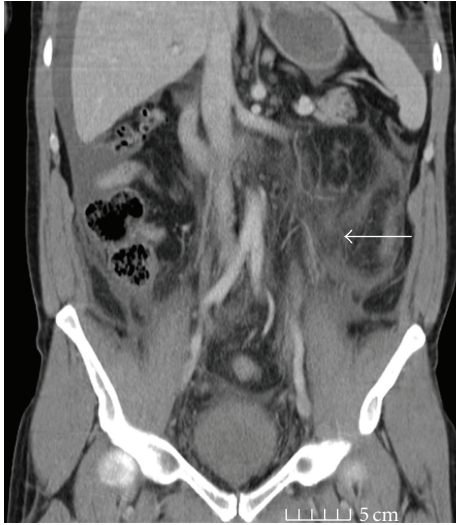
FIGURE 1: Coronal computerised tomography image showing diffuse inflammation affecting the peritoneum of the left side of the abdomen, the pelvis and the left psoas and retroperitoneum. (Marked by white arrow).

left intensified the pain. Initial investigations showed a raised white count and a raised CRP of more than 100 mg/L but normal renal and hepatic function. He underwent chest and abdominal radiography which showed loss of the left psoas shadow but normal abdominal gas pattern and no pneumoperitoneum.