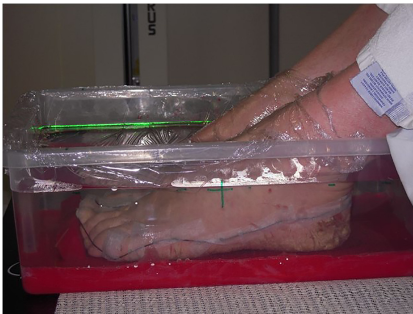
Figure 3. Feet positioned in the custom-made water bath.

eighth fraction. It was noted by the eleventh fraction that the hands were improving in the treatment area; however, there was progression outside the treatment area on thumbs and fingers.