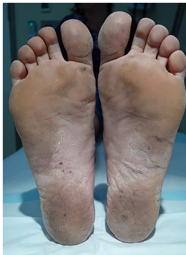
Figure 5. 12 months post-treatment plantar psoriasis.

conditions. 4 However, the relationship between low-dose ionising radiation and the cellular and molecular mechanisms involved in inflammatory skin conditions is extremely complex and not well understood. Fractionated doses of less than 1 Gy to a total dose of 6 Gy have been shown to inhibit well established inflammatory processes