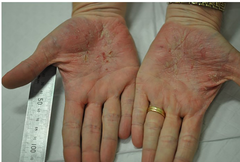
Figure 2. Left and right palms at presentation prior to receiving superficial kilovoltage radiation therapy.