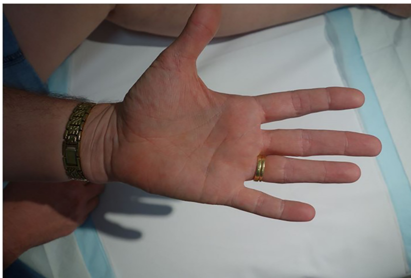
Figure 6. 12 months post-treatment right palmer psoriasis.