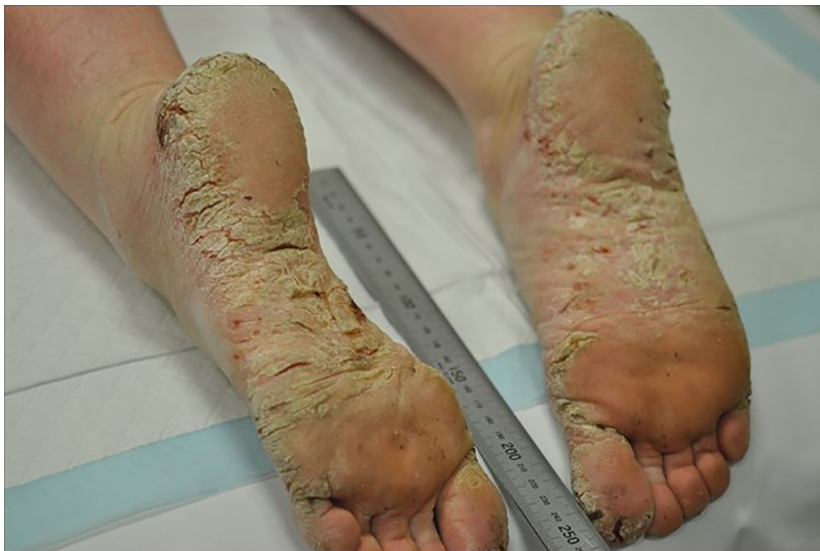
Figure 1. Left and right soles at presentation affected by severe, chronic hyperkeratotic palmoplantar psoriasis prior to receiving radiation therapy.

At the time of the fifth fraction, visible improvement was noted on both palms and feet, coinciding with an improvement in patient gait and reduction in pain. By the seventh fraction, some erythema and dryness had developed on the dorsum of the hands; however, the psoriasis had continued to improve. The lesions on the feet appeared to have decreased in thickness, although new cracks were developing. Despite this, the patients' pain had decreased so significantly that she was able to bear weight and no longer required a wheelchair by the