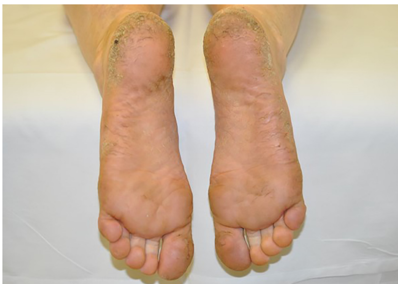
Figure 7. Four years post-treatment plantar psoriasis.

such as those seen in chronic psoriasis, hence providing a therapeutic effect. 5 In vivo studies completed on rabbit and rat models support this low dose and fractionation showing a reduction in inflammation and associated symptoms when exposed to 0.5–2 Gy per treatment to a total dose of most commonly 5 Gy. 4 Despite this, dose regimens recommended specifically for chronic psoriasis are limited by a lack of rigorous scientific evidence. Although the available literature discusses similar dose and fractionations, it fails to recommend a specific RT regimen for ultimate long-term control.