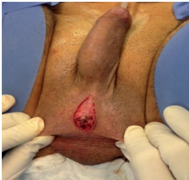
Figure 2 - Bulbar urethra placement of AS in modified scrotal approach.