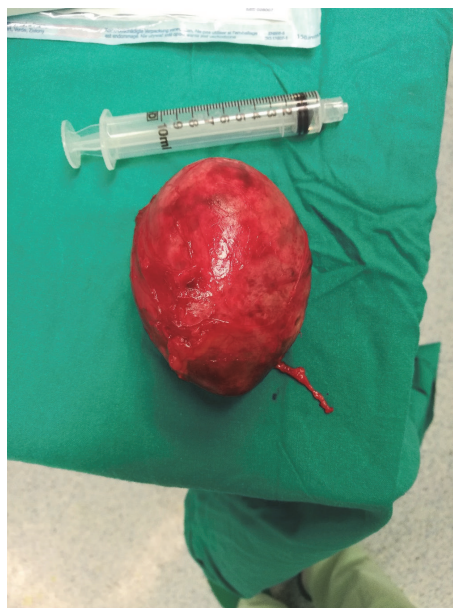
FIGURE 2: The excised mass had well-circumscribed smooth borders and rubbery consistency. It is covered by a thin and focally congested membrane. It weighs 157g and measures 7.5cm x 5.5cm x 5.5cm. Cut surface shows unilocular cystic mass filled with beige brown soft material and hair shafts.