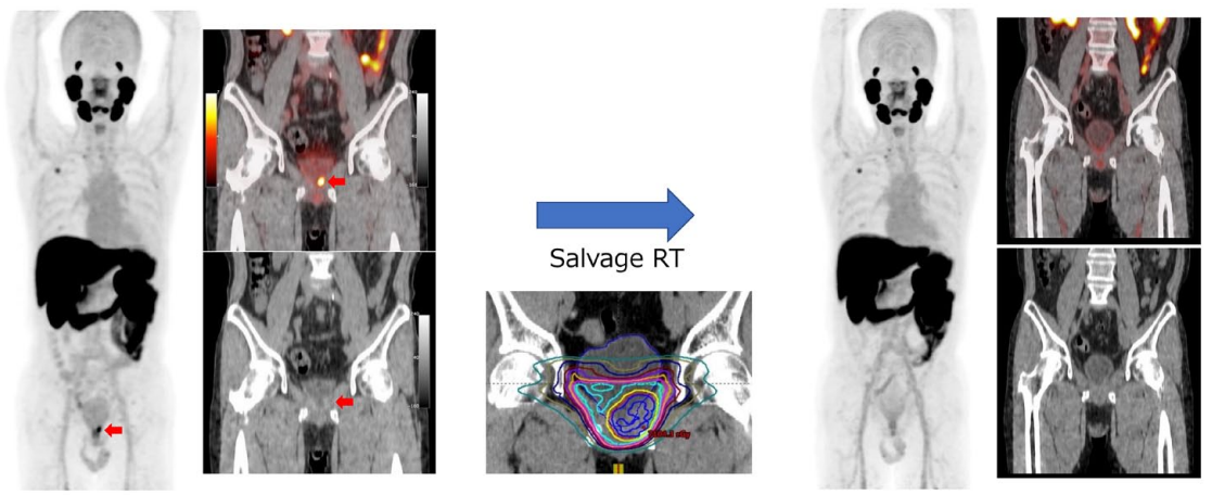
PSA: 0.19 ng/mL