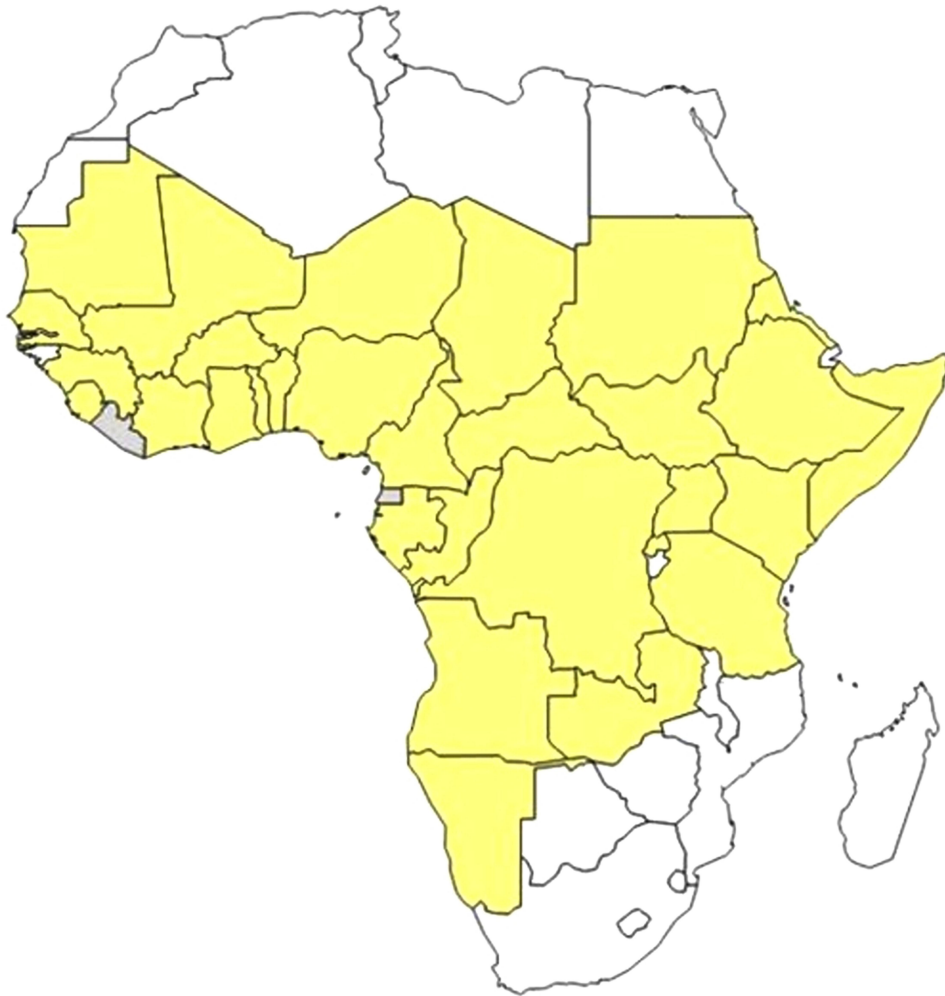
Figure 2 CBPP affected countries in Africa: 2004–2014. Source:

Notes: Reproduced with permission from FAO, 2016, Can contagious bovine pleuropneumonia (CBPP) be eradicated? http://www.fao.org/3/a-i6126e.pdf . 54