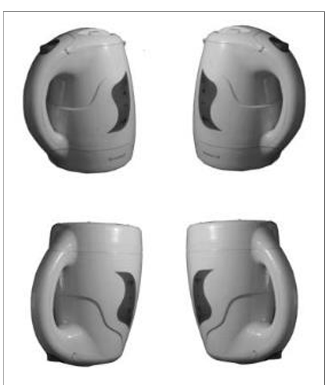
FIGURE 1 | Examples of the stimuli used in Experiment 1: left orientation, upright; right orientation, upright; left orientation, inverted; right orientation, inverted.

During the task, they were required to indicate as quickly as possible whether the object was upright or inverted by pressing the corresponding response key. Each participant carried out two blocks of 88 trials with a break of 3 min between blocks. In one block, subjects were to respond with their right hand for upright objects and their left hand for inverted objects. In the second block, they were asked to do the opposite – to respond with their right hand for inverted objects and their left hand for upright objects. The order of these blocks was counterbalanced between subjects. Within each block, 44 randomized trials were primed by the participant's surname and the other 44, by the imaginary surname "Rani." Before carrying out each block, the subject was informed that his surname would appear before objects as if he owned them or the surname Rani would appear before objects as if Rani owned them, and