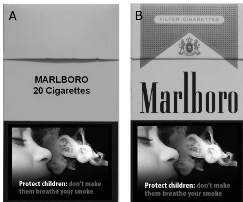
Figure 1 Examples of the cigarette pack stimuli presented on-screen prior to choice between the tobacco- versus chocolate-seeking response in the Pavlovian to instrumental transfer (PIT) test: (a) plain pack; (b) branded pack

daily. Participants were sampled in this way to ensure a normal distribution of individuals across the continuum of smoking heaviness indexed in these studies by cigarettes smoked on smoking days. All participants were asked to abstain overnight from smoking prior to completing the study, and compliance was checked with breath carbon monoxide (CO) measurement and self-report. Participants were debriefed and reimbursed £5 for their time and expenses, and ethical approval was granted by the University of Bristol, Faculty of Science Research Ethics Committee. We calculated the required sample size for experiment 1 to demonstrate a PIT effect produced by the branded cues, on the assumption that the effect size would be similar to that observed for the cigarette cues used in a previous published study [13]. This effect size ( d_z = 0.79 ) indicated that a sample size of n = 24 would provide 95% power at an alpha level of 5%.