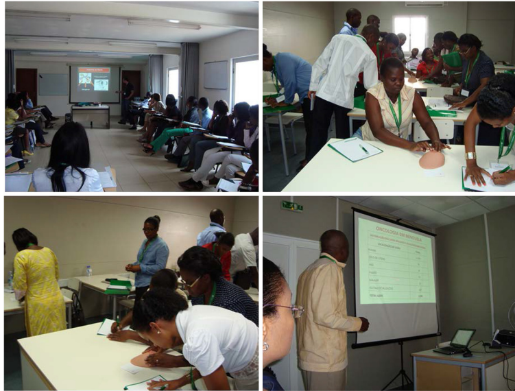
Fig. 2 Medical education of general doctors of municipal hospitals regarding breast cancer. Specific consent to publish the images was obtained from all individuals

for cancer control of cervix, breast and prostate malignancies and patient management under the Angola Municipal Health Services Strengthening Project. The aims of this program are health education, early breast cancer diagnosis and patient management (Fig. 2). The Breast Health Global Initiative recommendations from the 2007 Summit were to promote breast self-awareness and clinical breast examination (CBE) at the basic level and to encourage women to seek medical evaluation of breast problems and diagnostic imaging, such as ultrasound and mammography,