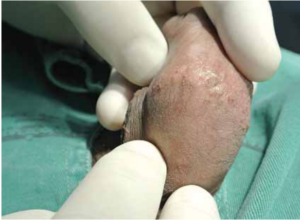
FIGURE 1: Diminutive papules in the body of penis