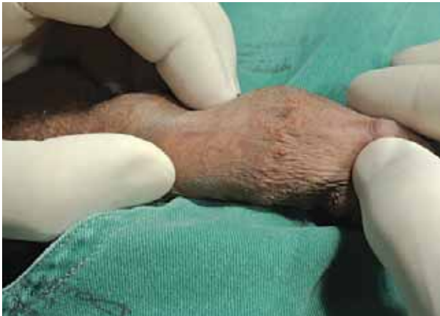
FIGURE 2: Papules on the body of penis. Notice location of area corresponding to insertion of foreskin