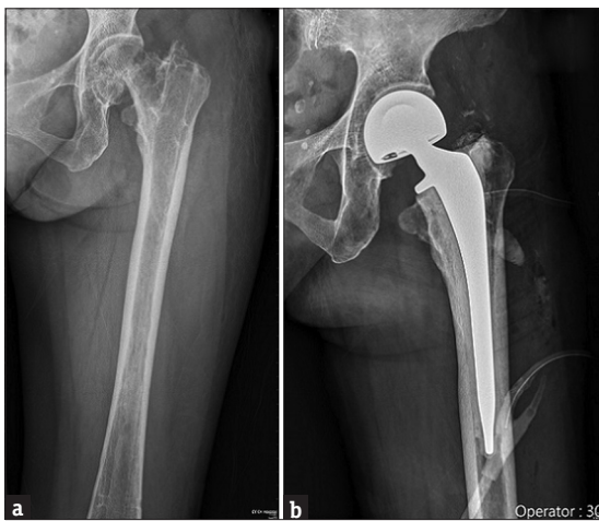
Figure 3: Left femoral fracture before (a) and after (b) the operation. Left ipsilateral subcapital femoral neck fracture was found (a) 5 days after implants removal, and cemented bipolar hemiarthroplasty was done (b) afterward

and decreased failure strength of the neck after implant removal [5]. Among these fractures, subcapital femoral neck