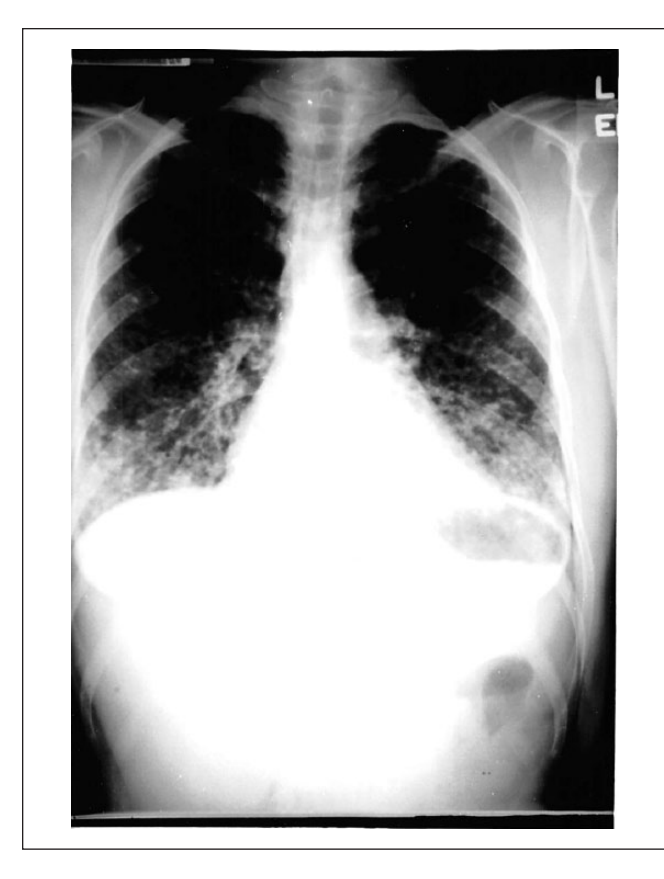
Figure 1. 1st Chest radiograph (Outpatient).