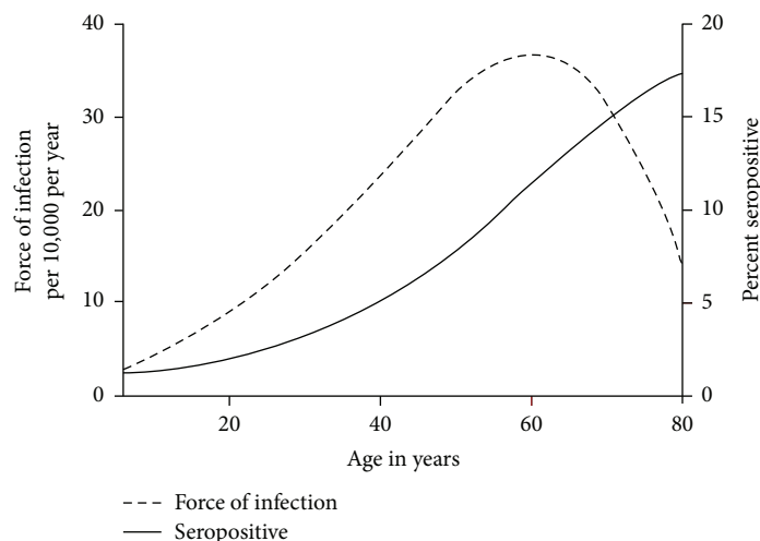
FIGURE 2: HEV-estimated force of infection and seropositivity by age for 2009–2012 NHANES participants.