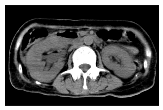
Figure 1 | Abdominal computed tomography on admission.

Antibiotics were immediately given, and strict glycemic control was able to be achieved by multiple daily injection of insulin with a total dosage of 15 units per day, resulting in robust decreases in WBC and CRP levels (Figure 2); however, the patient's back pain and low-grade fever still remained at 4 weeks after admission. In order to investigate the infection focuses other than the right kidney, abdominal computed