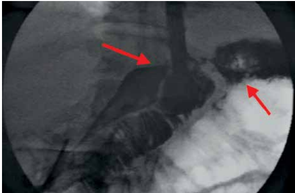
Photo 1. Fistula in anastomosis