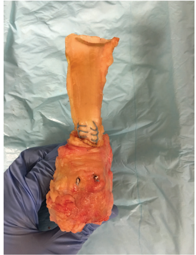
Figure 3. Suture anchor-augmented repair.

The Achilles repair constructs were tested on a pneumatic material testing machine (EnduraTEC Systems Corp). The Achilles repair constructs were secured to the