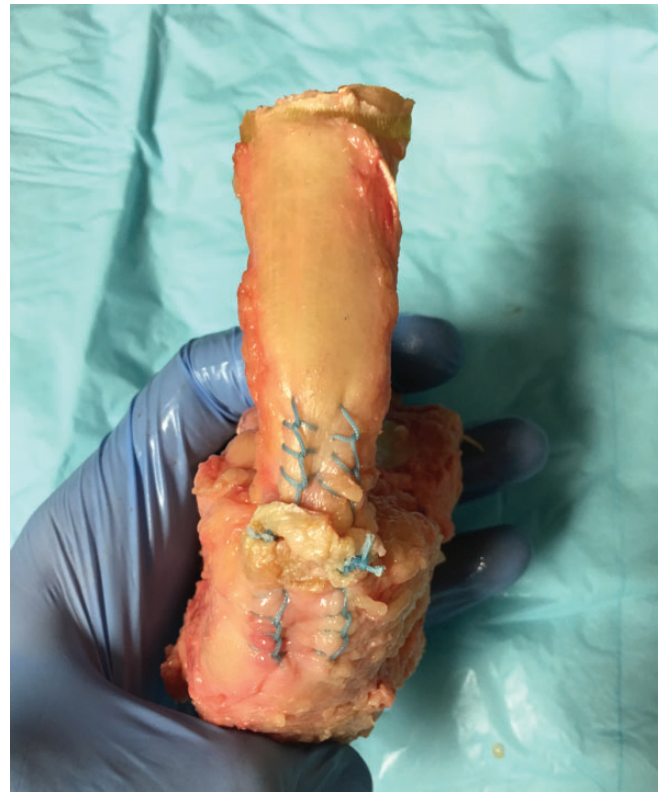
Figure 1. Suture-only repair.

Nine paired Achilles-calcaneus complexes were harvested from fresh-frozen cadaveric donors. Cadavers were donated by our institution's biosciences center. Each specimen was obtained by transecting the Achilles tendon approximately 12 cm proximal to its insertion onto the calcaneus followed by disarticulation of the calcaneus. 7 All specimens were inspected for any preexisting pathology and for gross abnormality. Additional soft tissue was resected until the specimen consisted of only the Achilles tendon and the calcaneus. The specimens were then soaked in sterile normal saline-soaked gauze and immediately frozen at -20^{\circ}\text{C} . 7 The