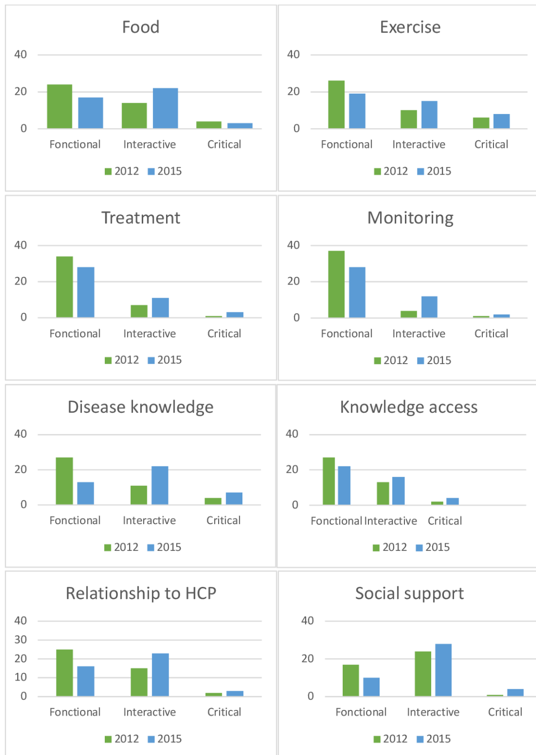
Figure 2 Number of patients with functional, interactive and critical relationships to the eight themes of disease management in 2012 (first-round interviews) and 2015 (second round interviews). Ermies ethnoscio study, qualitative thematic analysis of interviews, n=42 participants. HCP, healthcare provider.

In this study, a fine qualitative approach of disease management analysed through the theoretical lens of the Nutbeam's HL scheme yielded useful insights for a comprehensive description of strengths and weaknesses at the individual and contextual level for people struggling with disease management. 25 The HLQ was used as a complement to describe the HL needs expressed