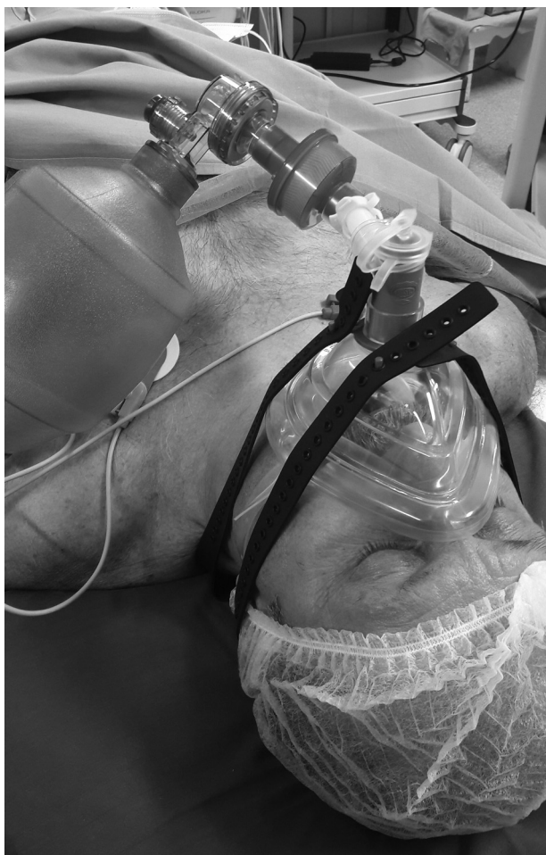
Fig. 1. New way to limit aerosol dispersion. The flexible instrument is introduced through a disposable mouthpiece, passing through a mask with bag valve in combination with a Mainz-type adapter. An antibacterial-antiviral filter link the adapter to the bag.

up for dressing and undressing. After the team entry, the doors of the theatre are closed to permit the action of the negative pressure. They are opened thirty minutes after the end of the procedure by the nurse who would then open the windows to promote the room's environmental ventilation. All the surfaces of the room, including the bed and the video stack are then sanitized with a dilution of 0.1% of sodium hypochlorite. The hospital cleaning service company would take care of the endoscopic centre hygiene