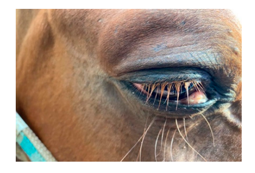
Figure 1. Mass on the right eye, of approximately 2 cm, located on the lower eyelid conjunctiva close to the medial canthus.

The growth was also firm and moderately friable. The anterior chamber, the iris, the vitreous, and the fundus were normal.