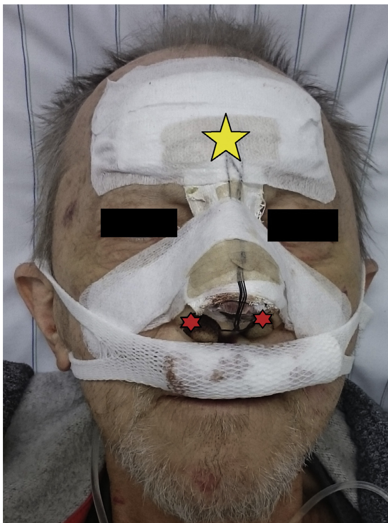
Fig. 1. Clinical photograph showing postoperative closed reduction of isolated nasal bone fracture with external nasal splint made of gypsum (yellow star) and intranasal Merocel® packings (red stars).