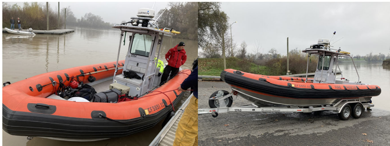
Manoukian © 2022 Prehospital and Disaster Medicine