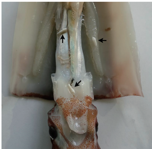
Fig. 1. Plerocercoids attached to a squid, Todarodes pacificus .

posited in the Department of Environmental Medical Biology, College of Medicine, Catholic Kwandong University.