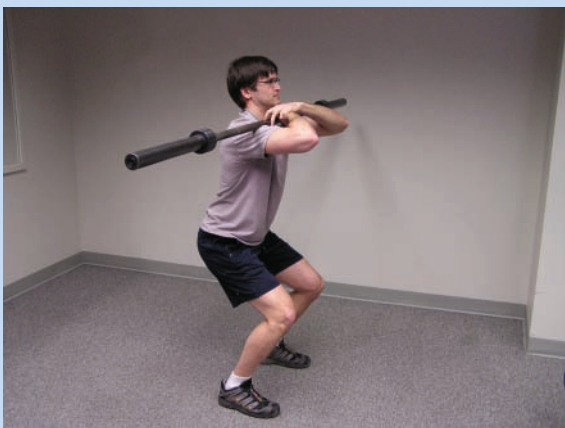
Figure 5. Front squat.

all-important scapular stabilizers and rotator cuff (Statue of Liberty exercise, Figure 6). A flexible bar overhead is oscillated for 30 seconds while holding the arm statically against a resistance band or tubing. Because muscular endurance