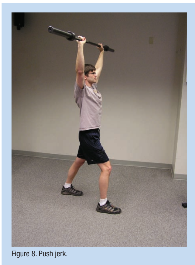
Figure 8. Push jerk.