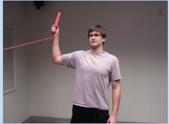
Figure 6. Statue of Liberty rotator cuff exercise.

all-important scapular stabilizers and rotator cuff (Statue of Liberty exercise, Figure 6). A flexible bar overhead is oscillated for 30 seconds while holding the arm statically against a resistance band or tubing. Because muscular endurance