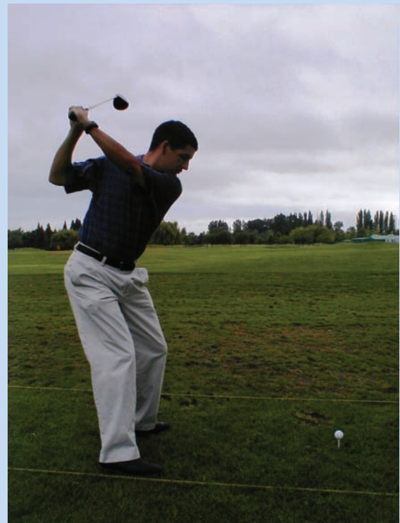
Figure 1. Transition phase of the golf swing. Hip internal rotation stretch.

The backswing begins with the takeaway. During this phase, the arms and shoulders work together as a triangular pendulum to begin taking the clubhead away from the ball. As the clubhead rises, the golfer continues to rotate the knees, hips, and spine, shifting weight toward the right foot. The top of the swing is known as the transition phase (Figure 1). At this point, the lower body begins the downswing while the upper body and club continue rotating away from the ball, which builds potential energy into the biomechanical system to be released during the downswing. By the time the upper