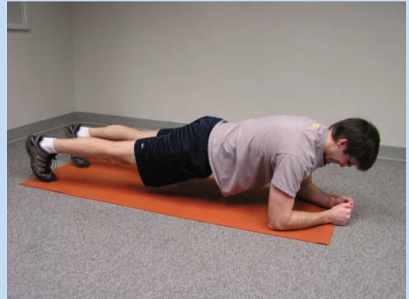
Figure 7. Prone plank.

capacity is a major factor in golf, 24 all exercises should be performed in the 15-repetition range, focusing on maintenance of form over any other variable.