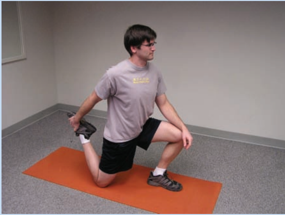
Figure 3. Hip flexor and rectus femoris stretch.