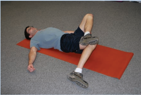
Figure 4. Hip internal rotation stretch.