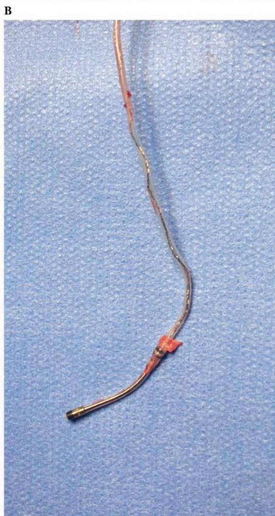
Figure 1: A: Fibrous ingrowth around an Attain Starfix™ 4195 (Medtronic, Minneapolis, MN, USA) lead with an implant duration of just over one year. B: A typical example of fibrous ingrowth around the proximal electrode of an Attain Ability™ 4196 (Medtronic, Minneapolis, MN, USA) lead with an implant duration of almost four times as long. Note the marked difference in the degree of fibrosis.