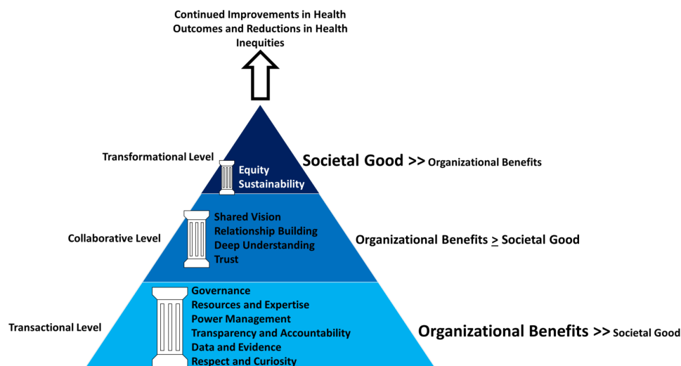
Figure 1 Theoretical model for global health partnerships.

from their parliaments to show quick results for not only health, but other sectors as well. It is very difficult for them to commit to long-term strategic plans and devote additional resources to health. At the same time, international partners face uncertainty as well, are scrutinised and held accountable by governance